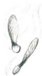
G. Maple "Whirlybirds"

5. Humans plant seeds on purpose. How do you think early humans first thought to plant seeds? How did it change their lives?