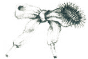
E. Cocklebur on shoelace

2. Animals eat the fruit or seeds. When the animals defecate (go to the bathroom), they leave the seeds far away from the parent plant.