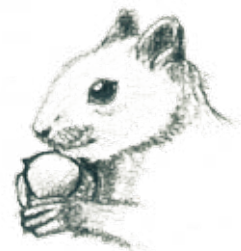
F. Squirrel with acorn

3. Some seeds stick to the fur or hair of an animal. Have you ever had anything stick to you or your clothes?