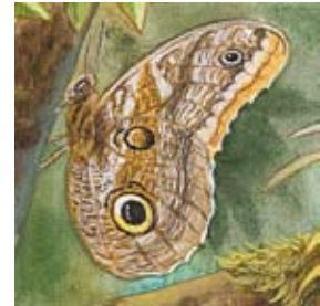
D. Owl Butterflies