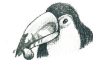
D. Toucan eating fig

6. Animals spread pollen from one plant to another when they fly.