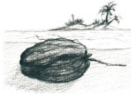
B. Coconut in ocean

2. Animals eat the fruit or seeds. When the animals defecate (go to the bathroom), they leave the seeds far away from the parent plant.