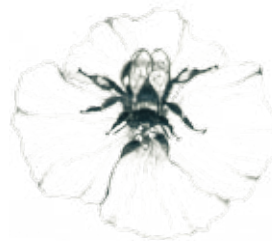
A. Bumble bee on flower

1. Wind helps to blow seeds away from the parent. Have you ever blown on dandelion thistles to make them "fly?"