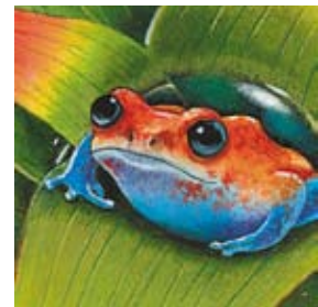
H. Poison Dart Frogs