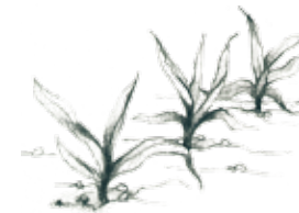
C. Corn in field

4. Animals may bury seeds to eat later but then forget about them.