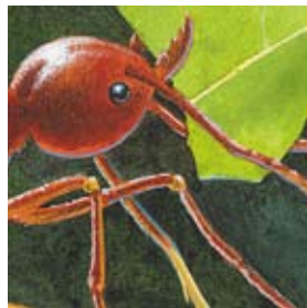
F. Leafcutter Ants